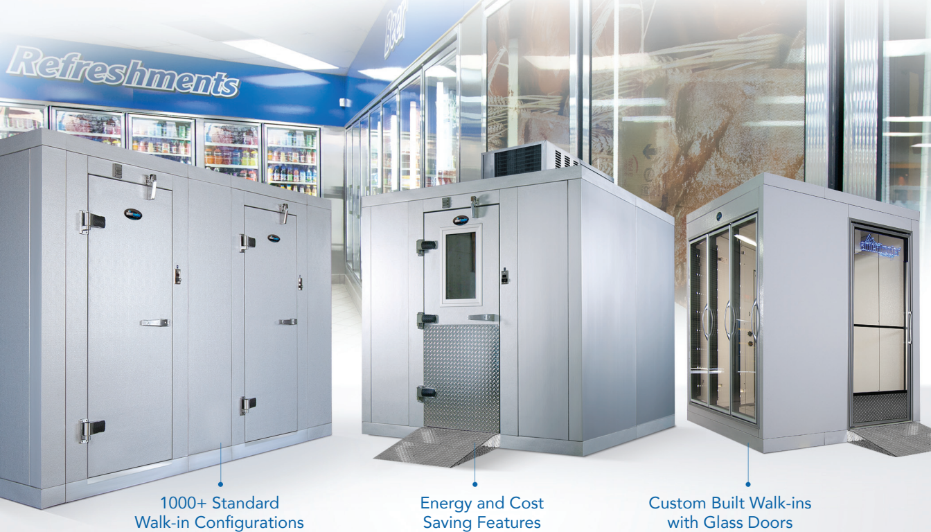
1000+ Standard Walk-in Configurations